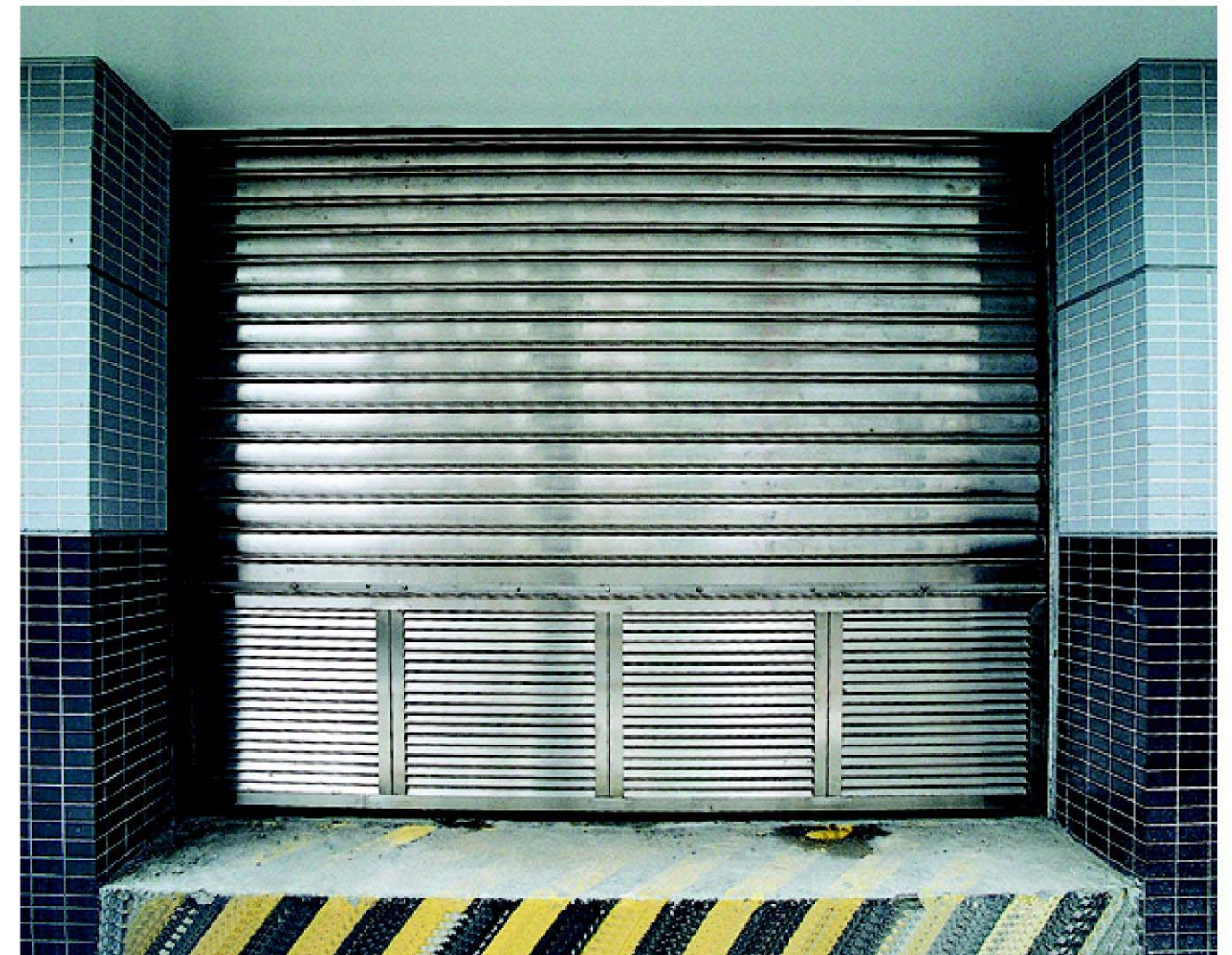
Fire rated shutter can be complied with fire rated air louver. CLP Substation