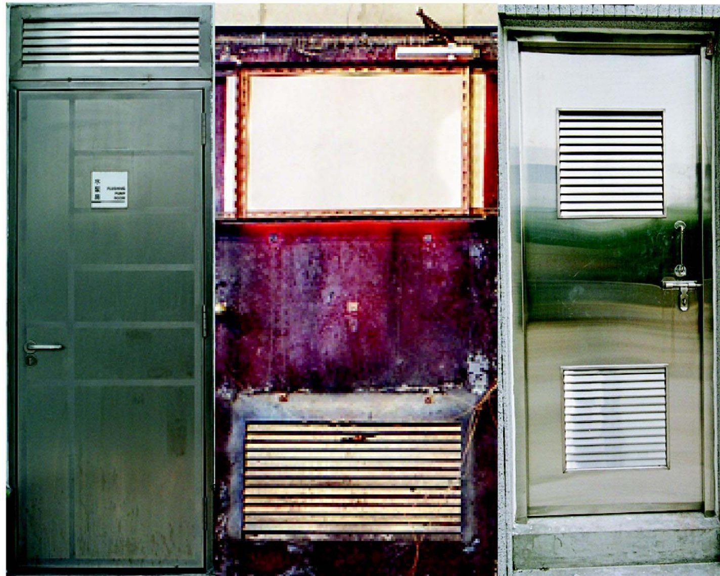
Upper / Lower fire rated louver can be fixed on fire rated door, 4 hrs fire rating with 42% air flow rate.

Application : • Attached on steel roller shutters • Attached on steel doorsets as lower half, upper half or full louver • Installed on concrete or masonry wall